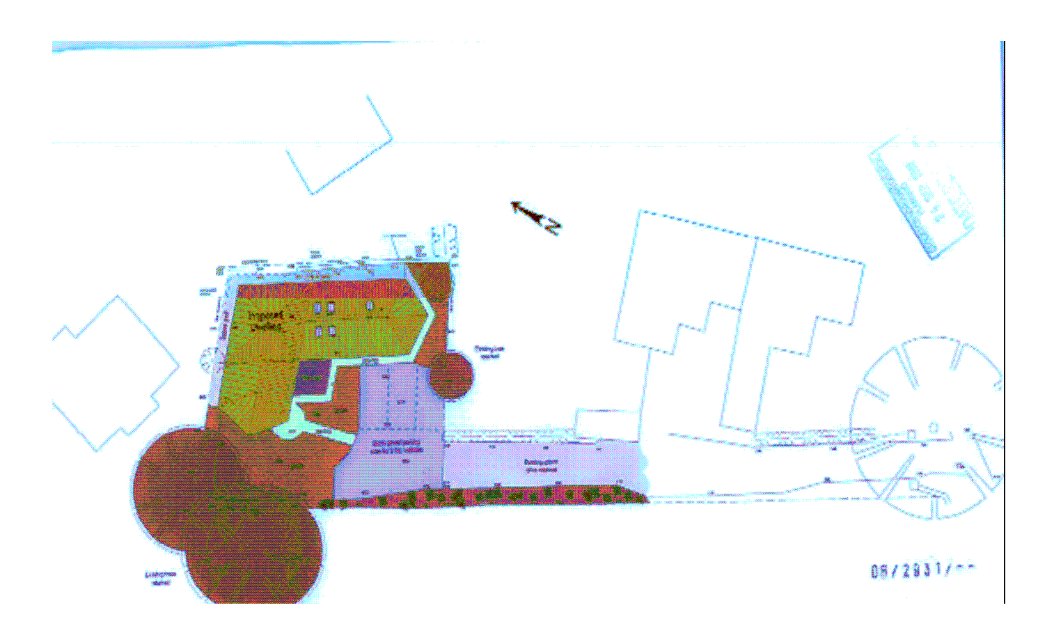
Site Plan as Refused